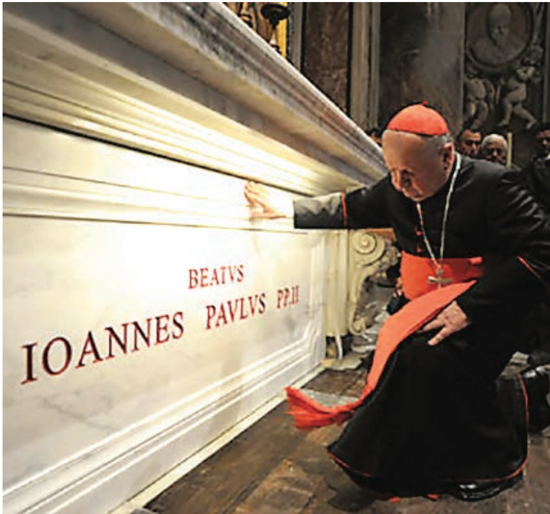
His Eminence Stanislaw Cardinal Dziwisz