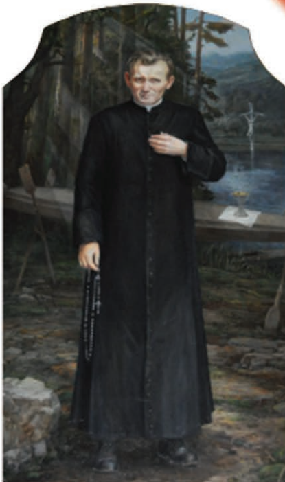
Father Karol Wojtyła (later Pope John Paul II)